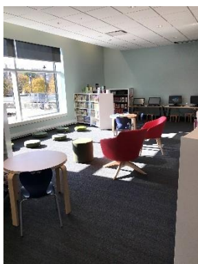
interior views of new library

During the more than its 25-year history the FOML has donated over $200,000 to the library. This includes over $100,000 to the new library building campaign. This would not have been possible without the dedicated support of volunteers and patrons of the FOML. The support of the FOML's activities, including the Net Shed and the summer Sunday Concert Series, has